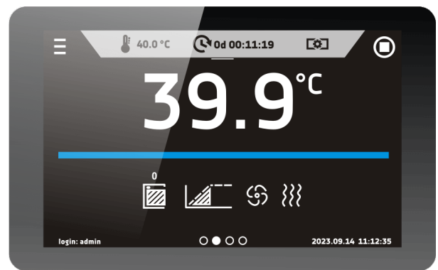
Smart PRO - preview screen